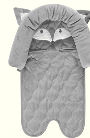
Insert sold separately CHECK for Use

NOTE: If you feel these items are necessary, only select items that are made of soft materials.