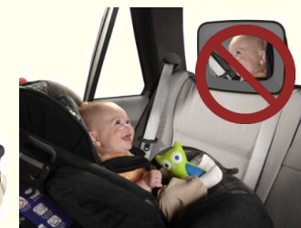
NOT Recommended for Use