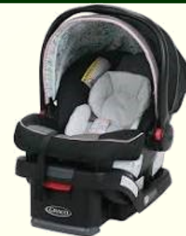
Insert came with car seat CORRECT Use