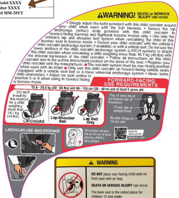
Airbag warning label on rear-facing car seats

Car seats that are missing the required warning and safety labels, or have labels that are poorly worded with grammatical errors, should not be used.