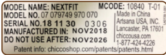
Model Number & Manufacture Date Label

Label includes the car seat manufacturer's name and address.