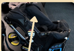
Example: Doona with fake and missing labels

Buy in person: Go to a retail store to help ensure the car seat was manufactured to meet federal safety requirements.