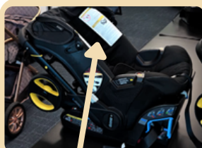
Example: Doona with required labels