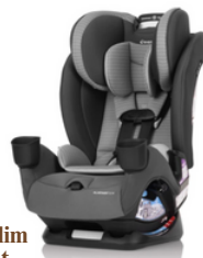
Evenflo All4Stages Slim All-in-One Car Seat