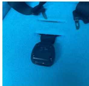
Crotch buckle opening

This issue does NOT affect the ability of the child restraint system to protect the occupant in the event of a motor vehicle crash.