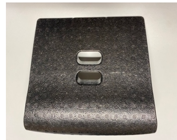
EPP foam seat cushion