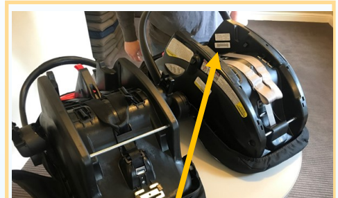
Look for the car seat manufacturer model number and manufacture date labels

Car seat manufacturers use the registration information to contact owners about safety issues, including recalls.